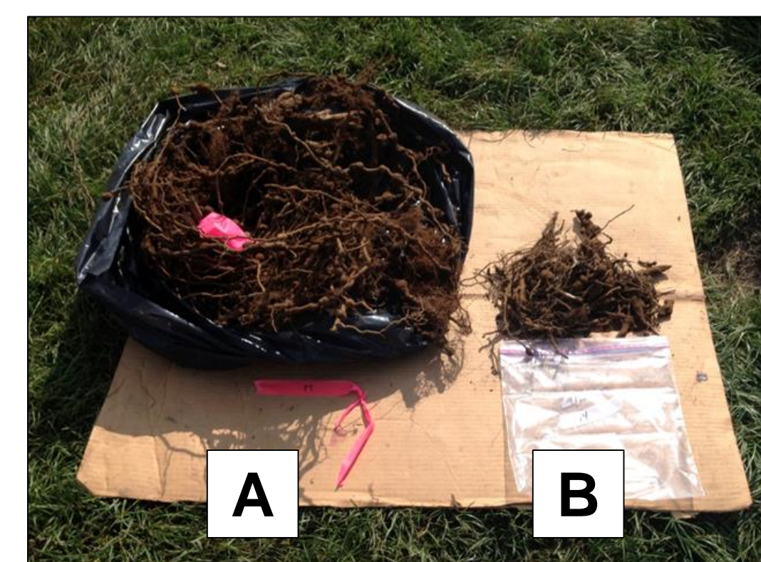
Figure 4. Volume of roots lifted to the soil surface (A) and remaining in the soil (B) after root removal in a 0.1 m 2 excavated plot.