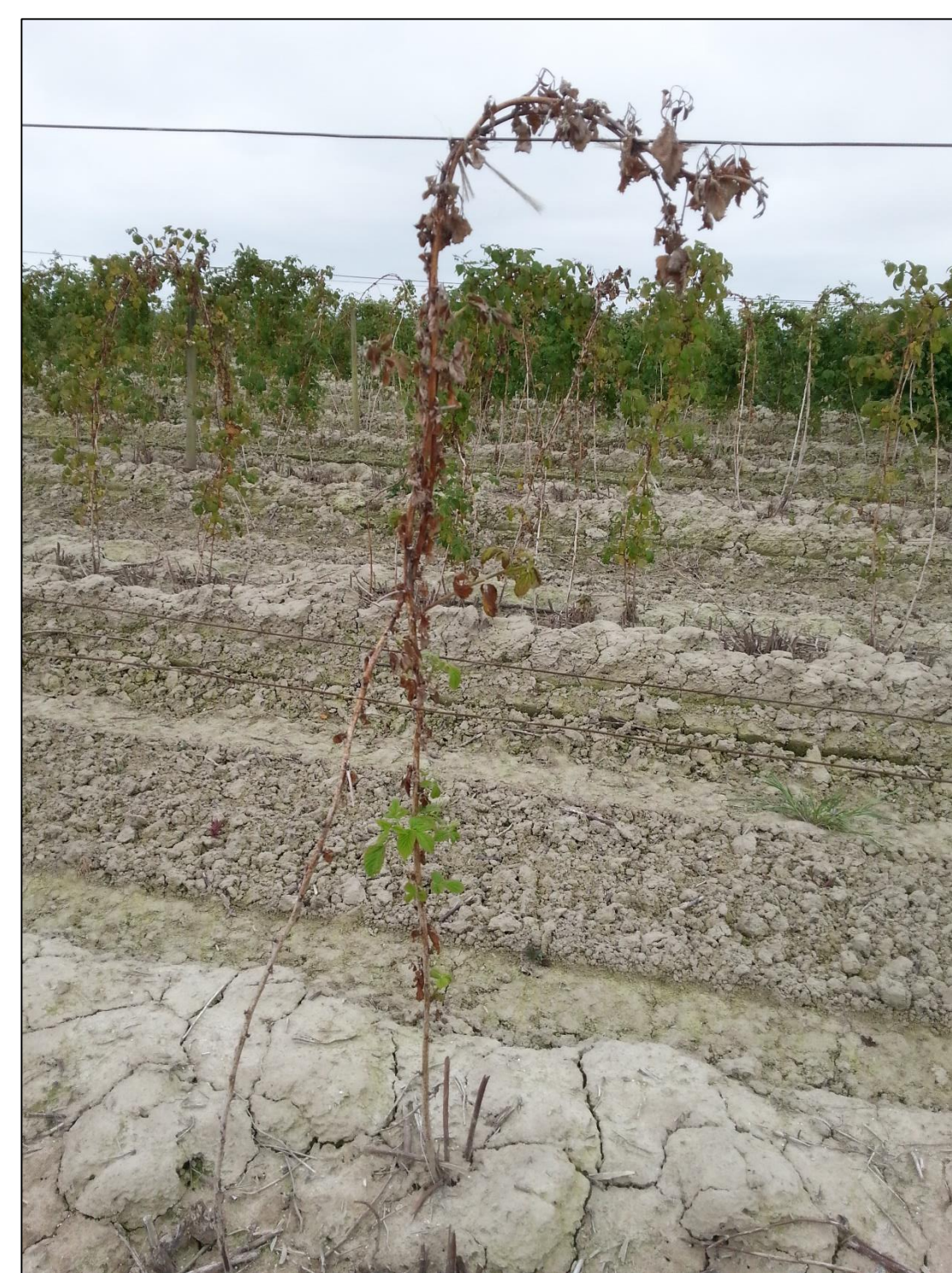
Figure 1. 'Tulameen' raspberry infected by P. rubi .