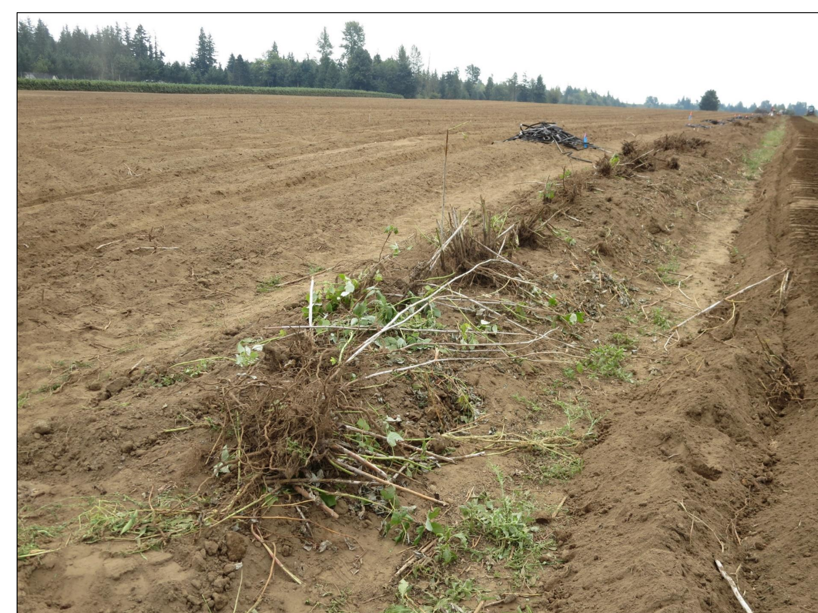
Figure 2. 'Meeker' raspberry field in the process of renovation. In most systems, residual root and crown materials in the field are incorporated into the soil prior to fall fumigation and replanting in spring.

This project explores the horticultural technique of raspberry root and crown removal as a pre-plant tool for the improved and integrated management of disease-causing organisms.