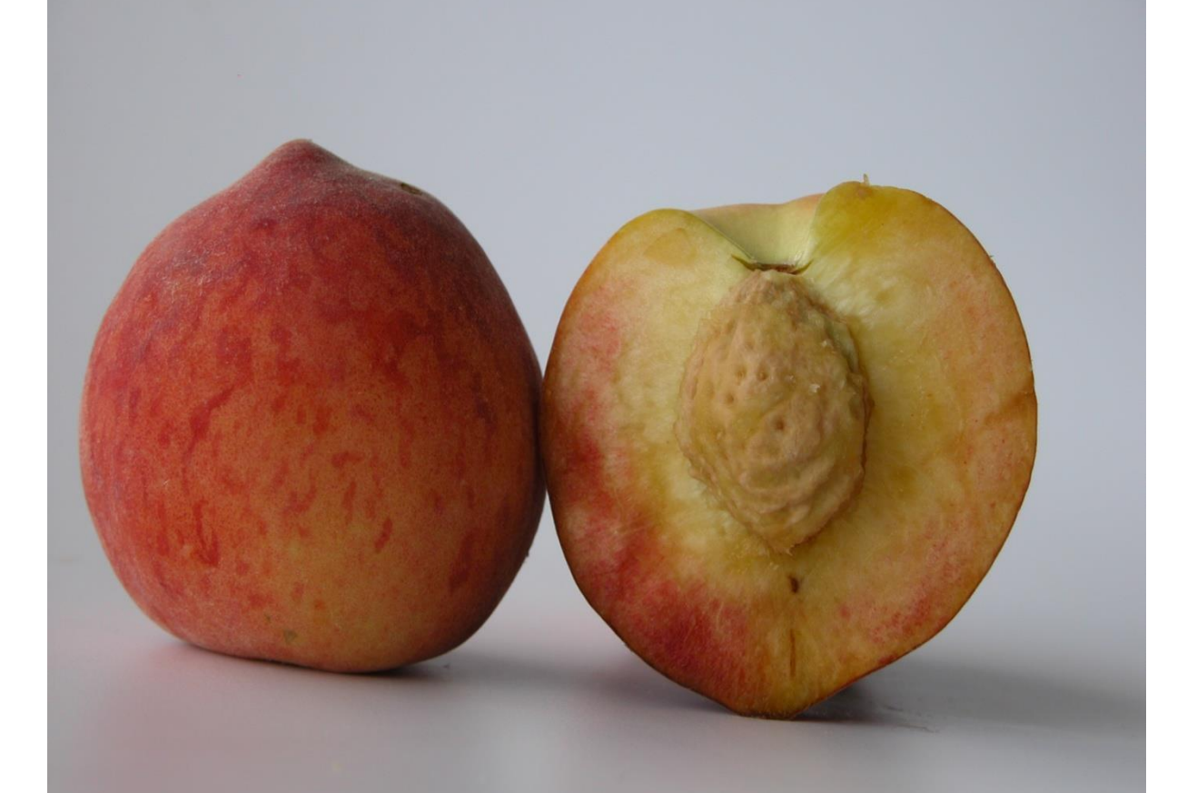
Royal Zest 1 Mid May

The Zest peach series, SMT1 and SMT2 bloom approximately one week before 'June Gold', whereas SMT3 blooms with 'June' Gold' in the medium chill zone (Table 1). Based on the relative bloom times of standard cultivars, these new peaches, SMT1 and SMT2 need about 550 chilling units (CU) whereas SMT3 requires about 650 CU to break dormancy. In spite of the earlier bloom, all seven have produced consistently in zones 2 (650-850 CU), 3 and 4 (500-750 CU) of Texas (Fig 1).