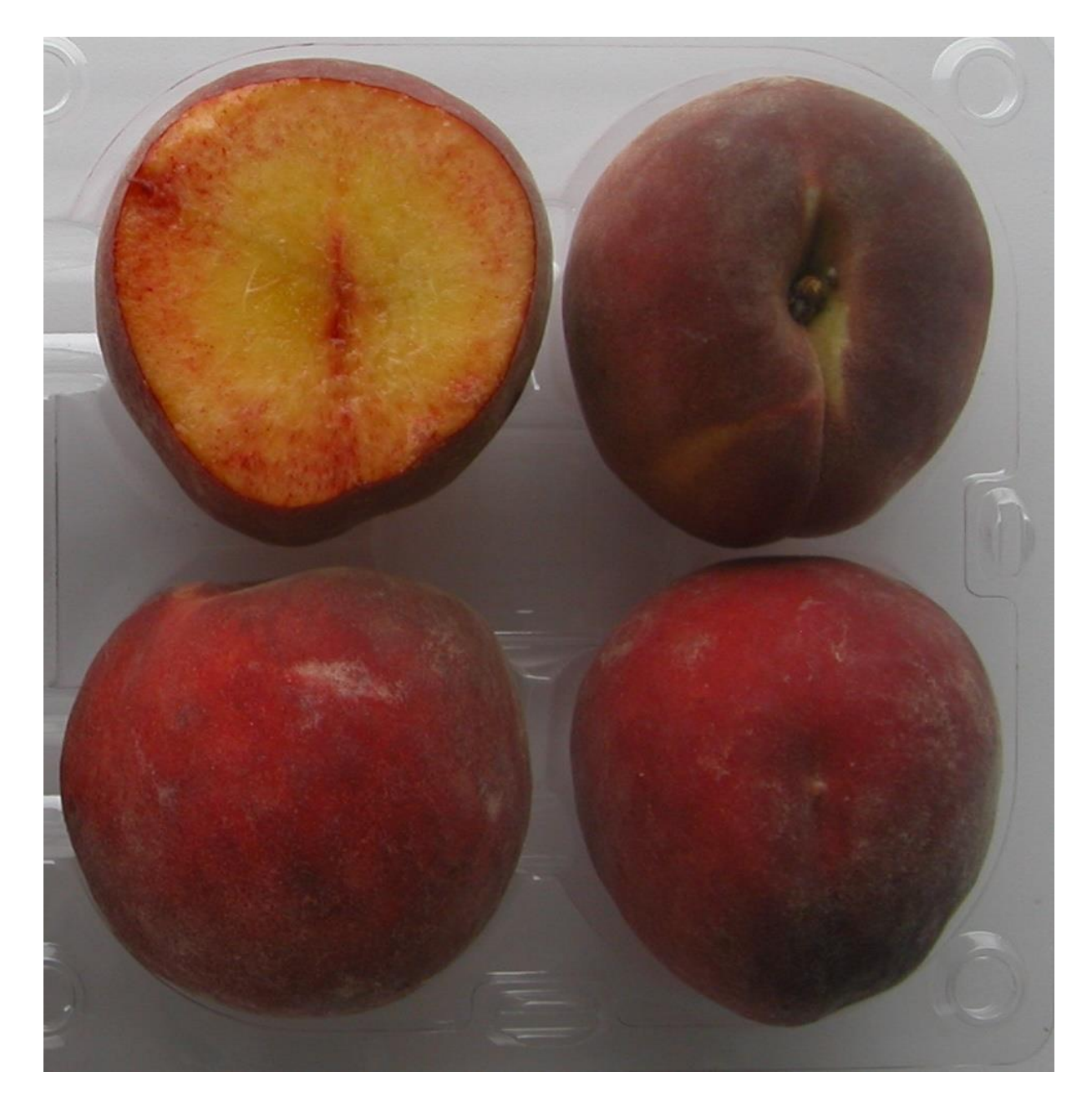
Royal Zest 3 – Early-Mid June