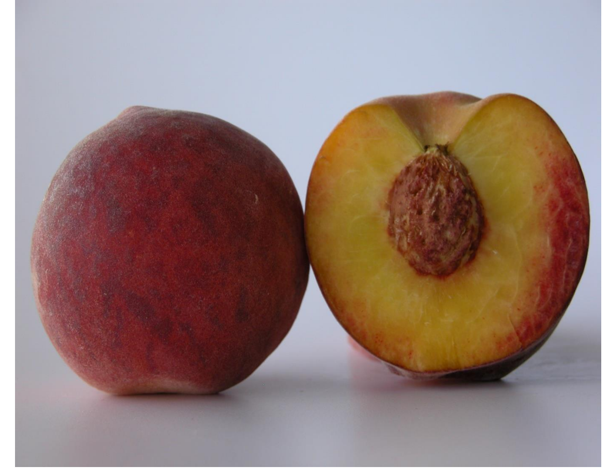
Royal Zest 2 - Early June