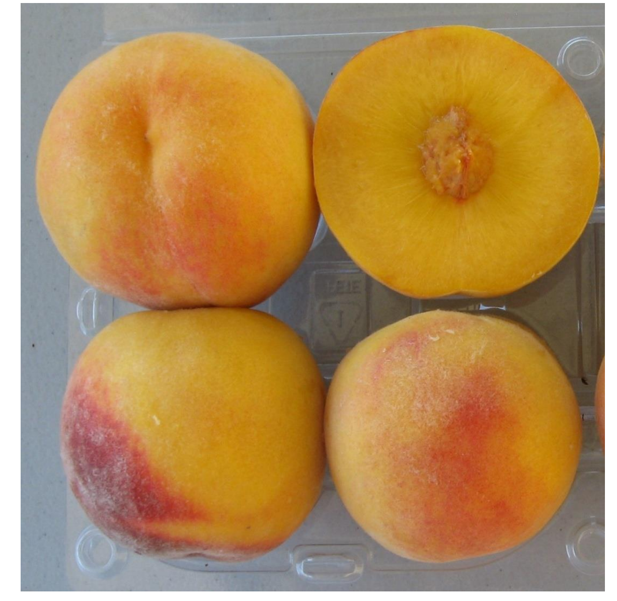
Golden Zest – Late June