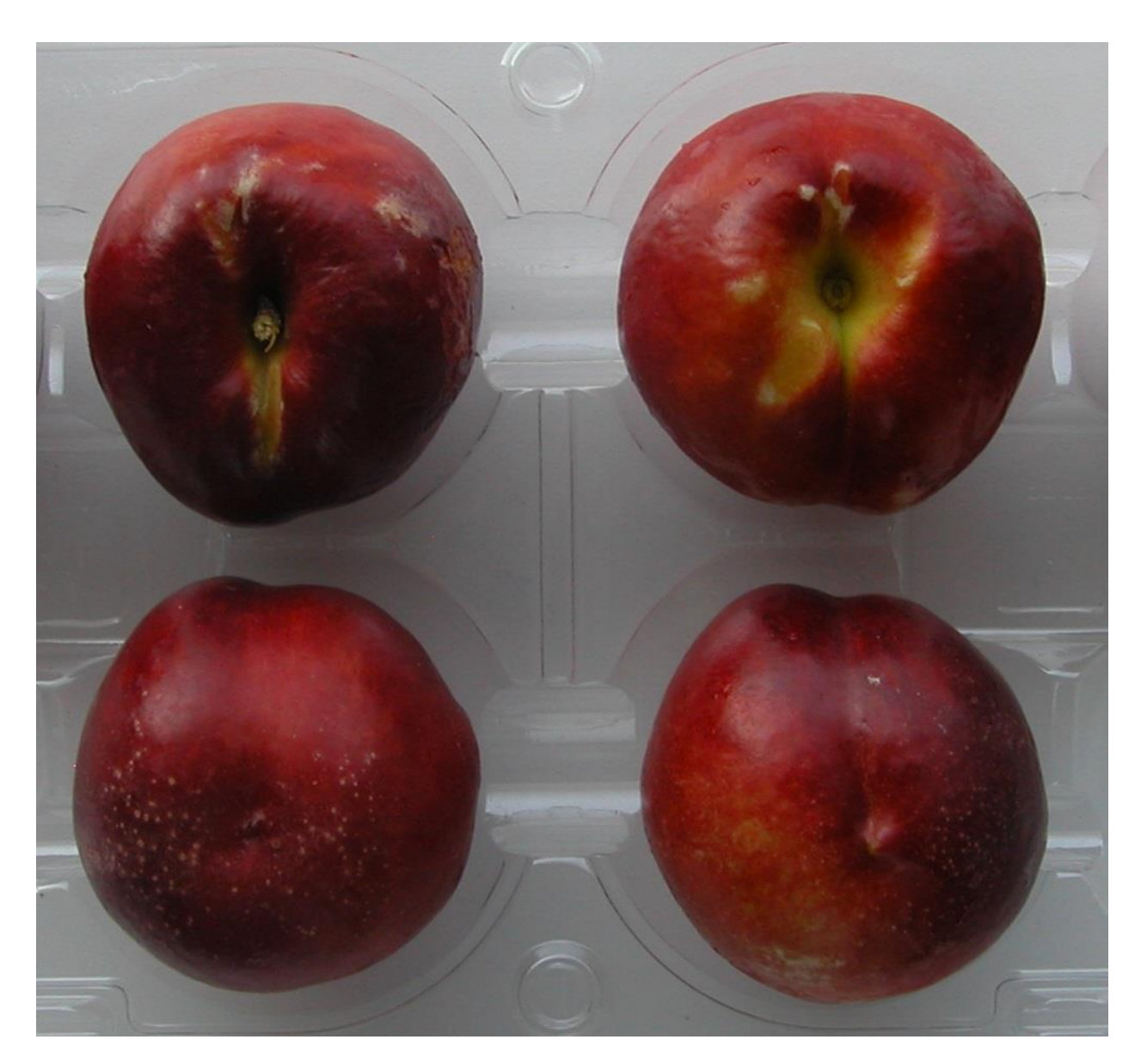
Smooth Texan One - Mid May