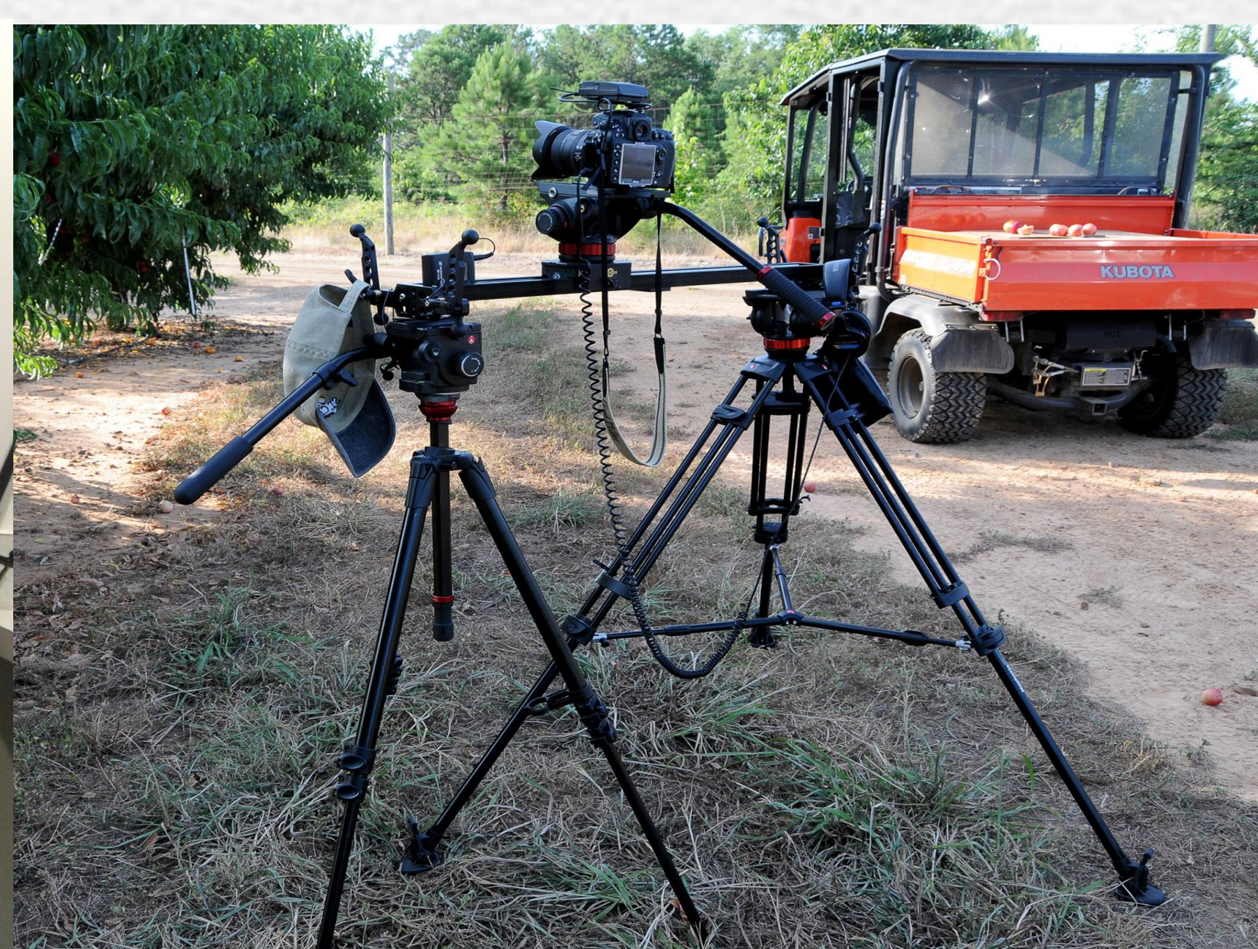
Fig. 2. A Nikon D800 SLR camera mounted on a Cinevate 38-inch slider mounted atop a pair of tripods for recording in the field.