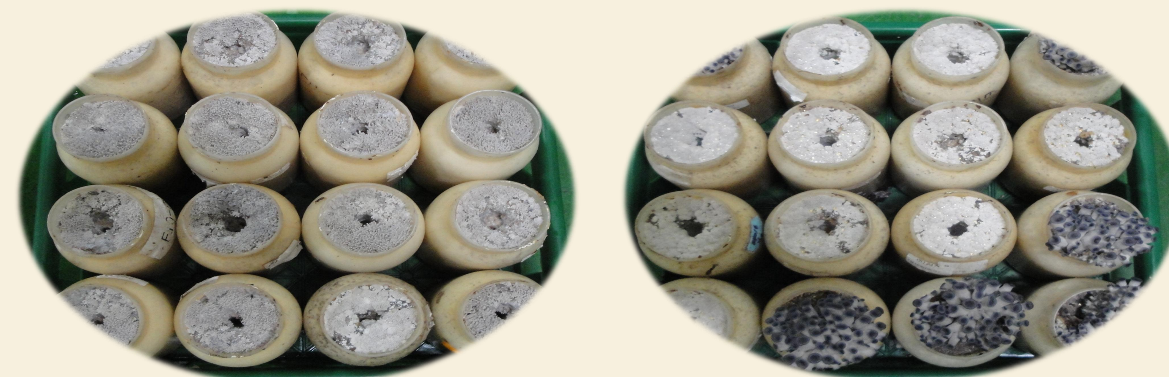
Fig 2. Side primordia in Pleurotus ostreatus according to post incubation period and temperature conditions(Gonji No. 7).