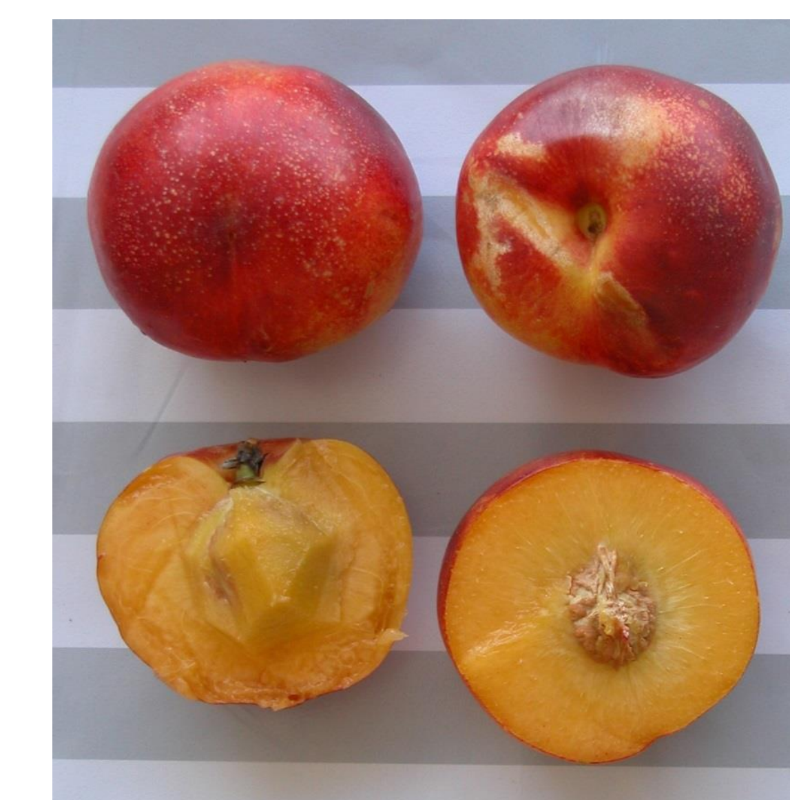
Smooth Zest Two