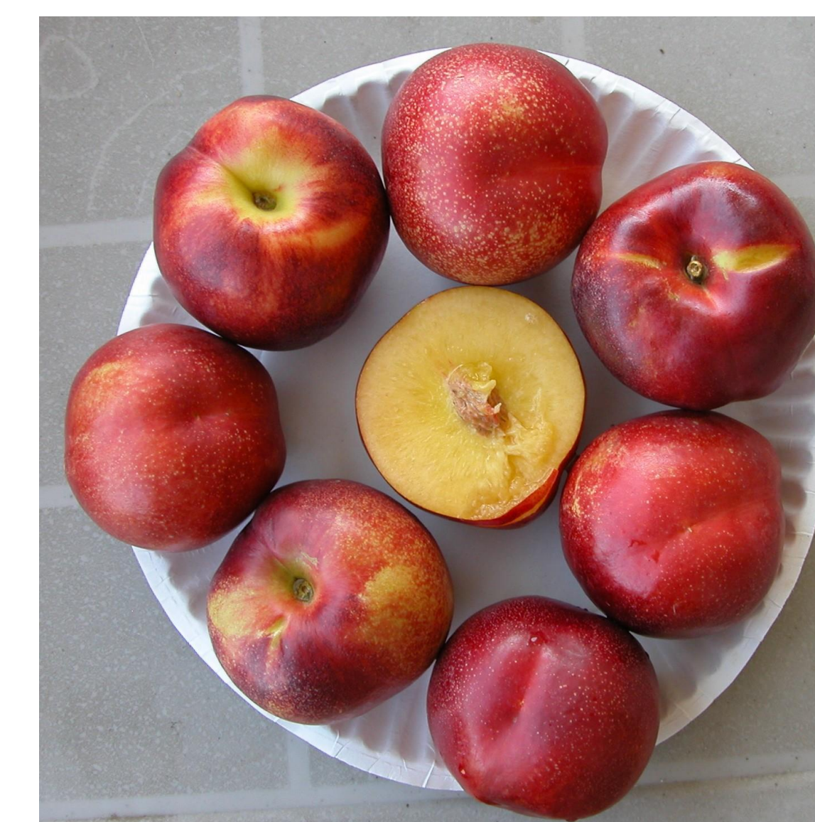
Smooth Delight Two