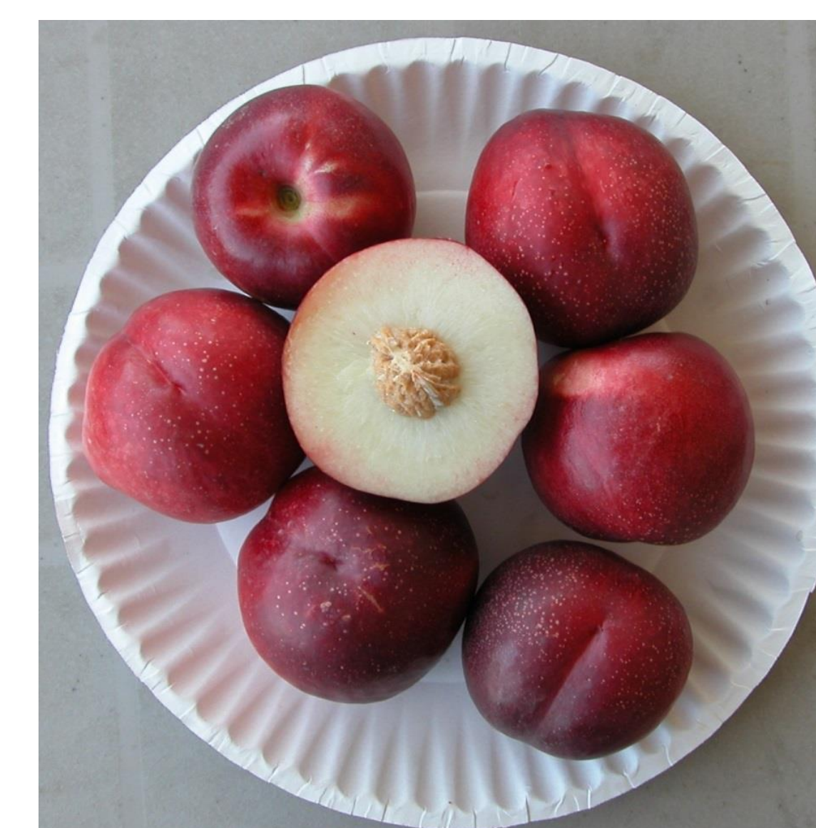
Smooth Zest One