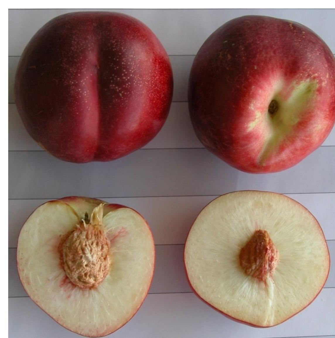
Smooth Delight One

Full bloom = 60-80% flowers open, Ripe date = date when 20% of the fruit is firm ripe. Rating scale 0 – 9; 0-4 = unacceptable, 5 = marginal, 6 = good, 7 = very good, 8-9 = excellent for commercial use. SZ1 = Smooth Zest One, SZ2 = Smooth Zest Two, SD1 = Smooth Delight One, SD2 = Smooth Delight Two.