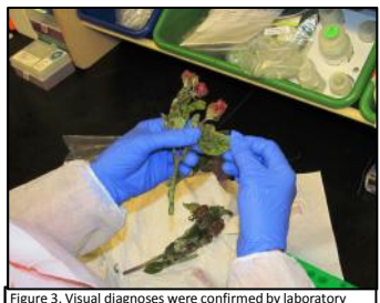
igure 3. Visual diagnoses were confirmed by laboratory testing to confirm presence of the eriophyid mites vectors nd/or molecular detection of the rose rosette virus