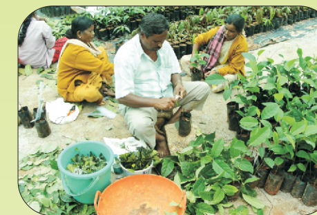
Skill training in jack grafting