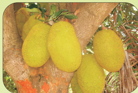
Jack tree with fruits