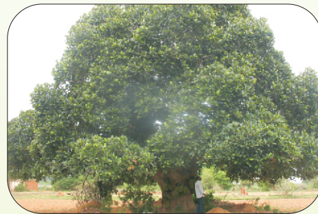
300 year old Jack tree