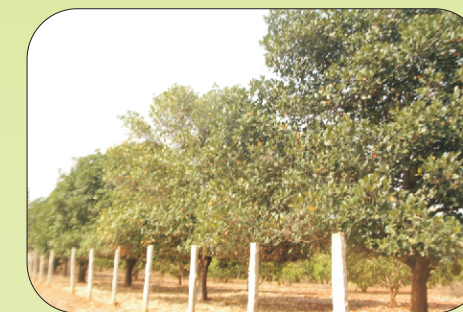
Avenue planting of jack