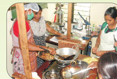
Training in value addition