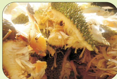
Wastage of jack fruits