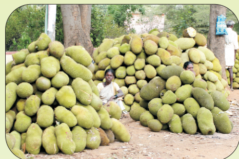
Sales to middle men