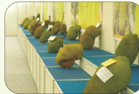
Jack fruits of elite progenies